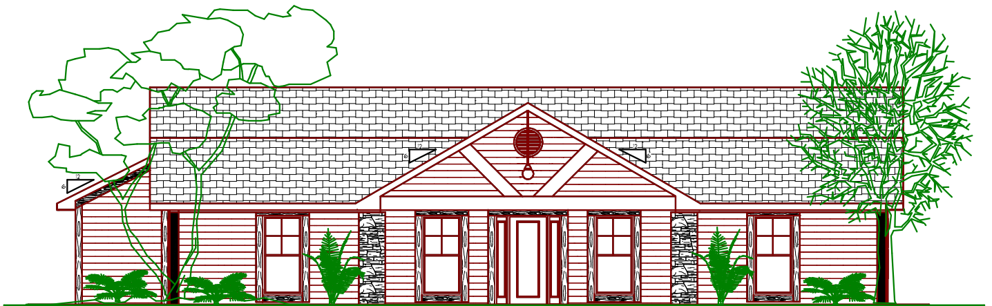
"THE MILLER RETREAT"